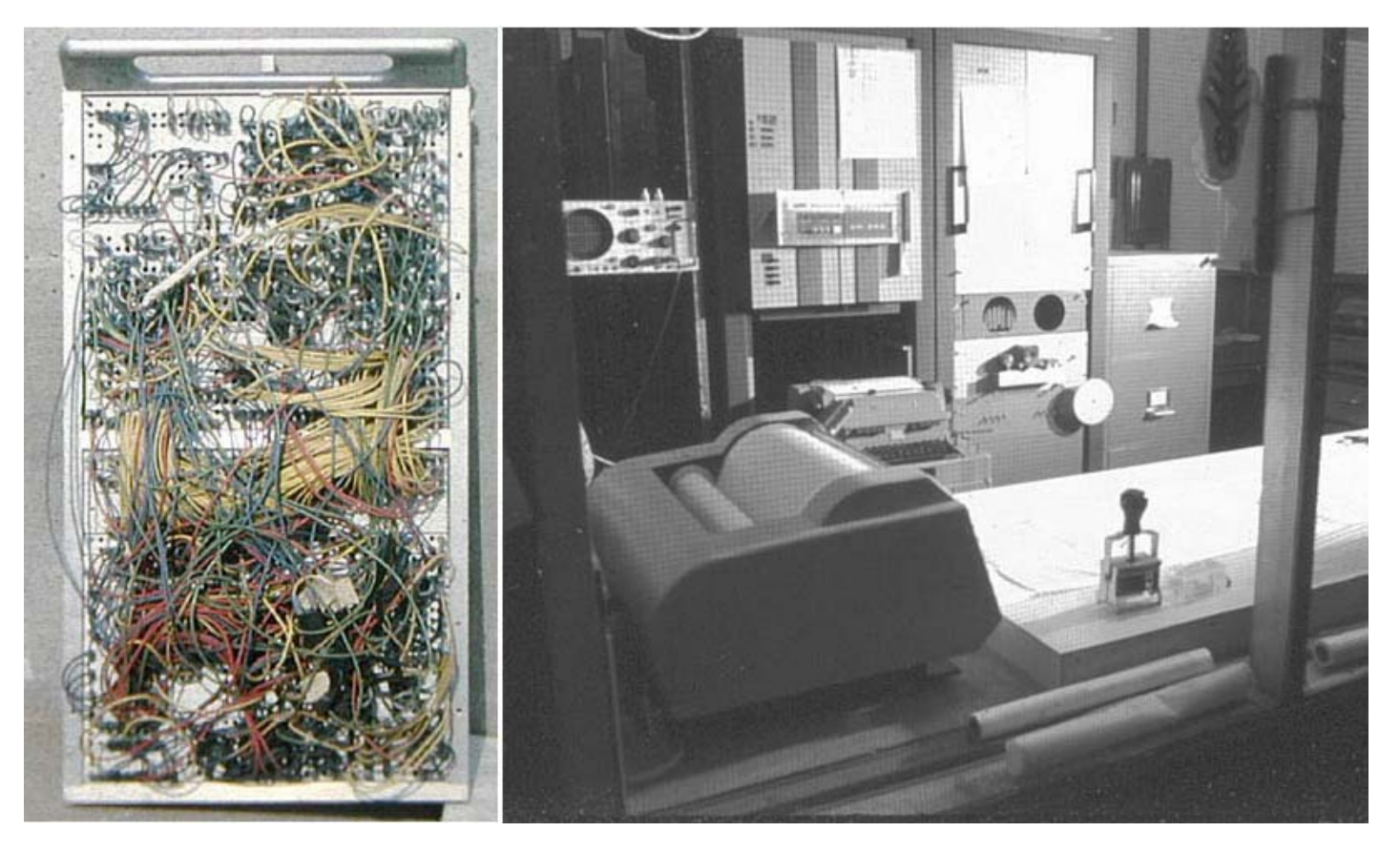
Wilkes microprogram controller for transmitter pulses